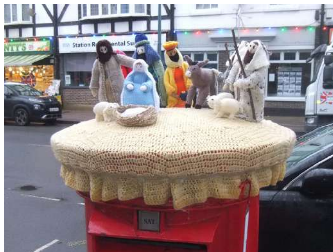
Nativity scene in Station Road at Christmas (2020)