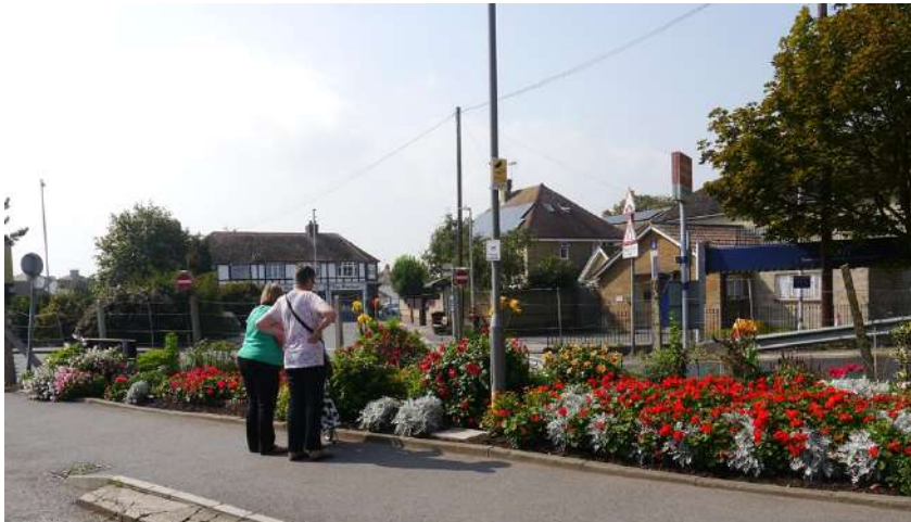
Flower bed near the station