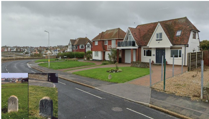
The Stone on a front lawn