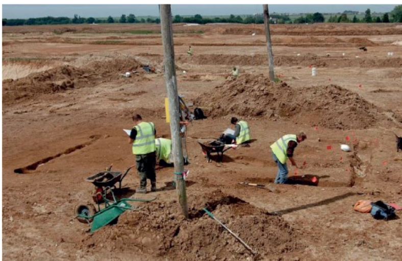
Medieval site at Thanet Earth under excavation (taken from Newsletter No. 2)