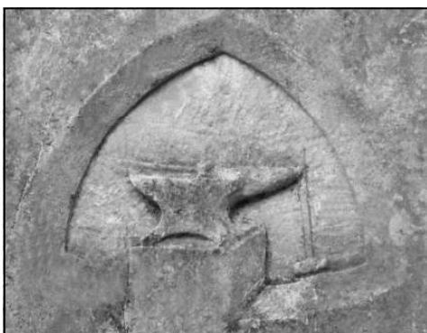
Blacksmith's Anvil engraving on Gravestone