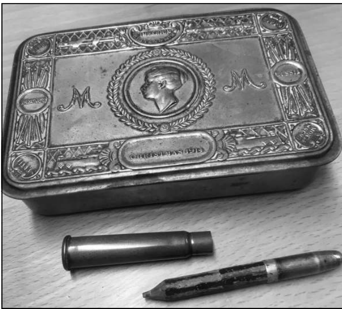
Princess Mary's Box 1914