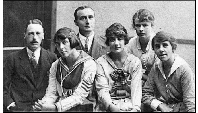
The Lena Ashwell YMCA Concert Party - Egypt

At the outbreak of war in 1914 Lena was determined that soldiers should not be deprived of culture, but should be entertained by actors and musicians. The War Office was against the idea, but she persevered and with the help of the YMCA managed, in January 1915, to get concert parties sent to France and later Malta and Egypt. Violin solos, string quartets, operatic arias, drama and poetry, were all delivered behind the front lines, usually three concerts a day.