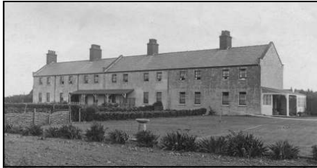
Coastguard Cottages at Epple Bay

The article went on to state that "Miss Ashwell owns a row of coastguard cottages at Birchington, where she delights to entertain poor professional girls in need of a holiday."