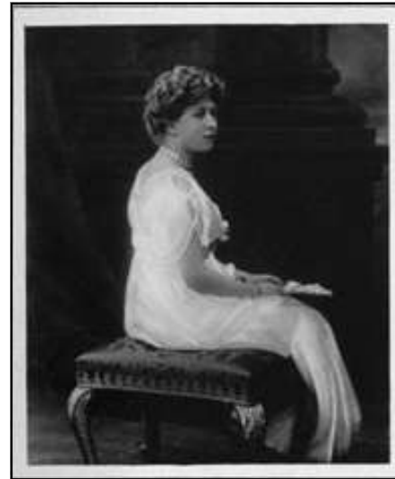
Photograph of Princess Mary Card enclosed in the box

Princess Mary, the 17 year old daughter of King George V & Queen Mary wished every soldier at the front and sailor afloat, to receive a Christmas gift. The boxes were funded as a result of a public appeal and raised a staggering £162,500, equivalent to £18,395,814 in 2018.