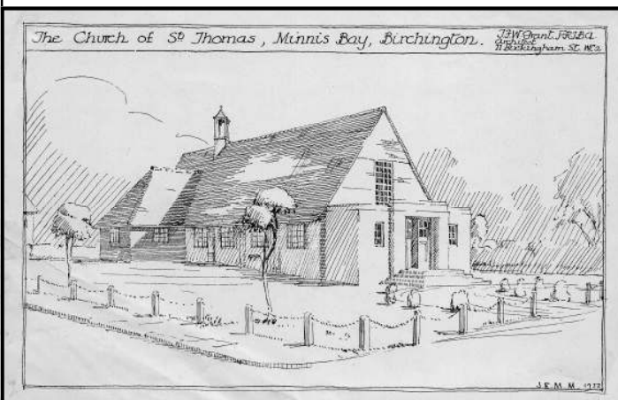
The Church of St Thomas, Minnis Bay