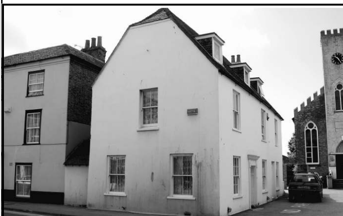
Southdown House 2006