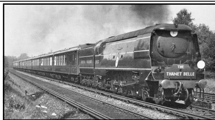
The Thanet Belle - 1948