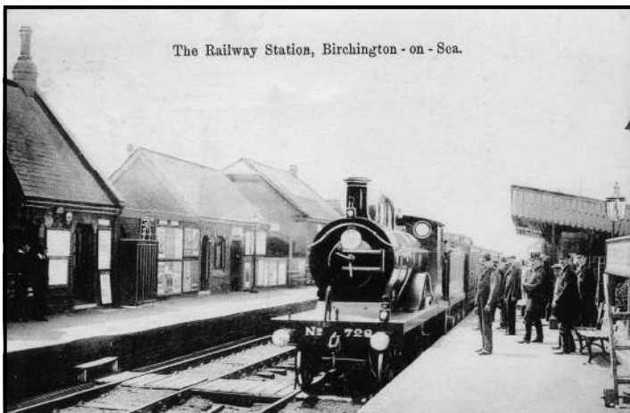
Birchington-on Sea Railway Station 1890

The latest display in Martin's window in Crescent Road tells a little of the story of Birchington's 'love affair' with the Railway . The arrival of the station in 1863 was what changed Birchington from a tiny rural hamlet, like its Mother Church Monkton, into the thriving community we have today. There are some who heartily regret this, but the arrival of the railway also introduced some fascinating elements into our village, including the Tower Bungalows, three private schools and three good-class hotels. Sadly the second two elements have now gone, but their legacy is still with us.