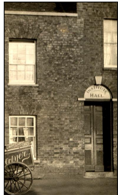
Institute entrance c. 1888