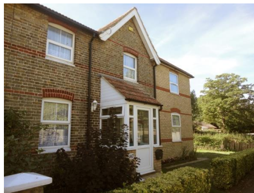
Old Joe's house at 1 East End Terrace - now listed as 147 Canterbury Rd The extension came after Joe's time there