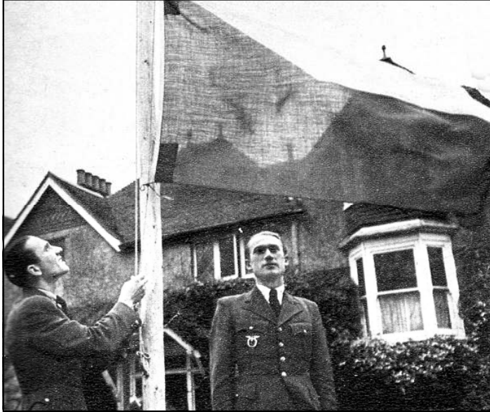
Czech Flag at Beaconsfield 1939-40

There is a photo showing them raising their flag outside "their new Air Base" in " World War II" Magazine No: 66 (1973)