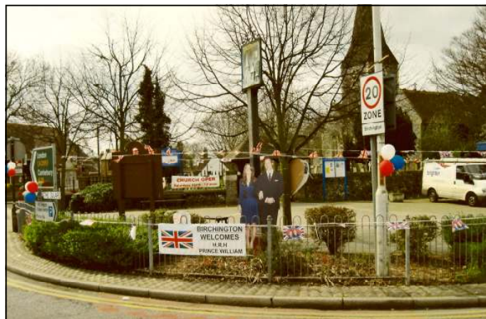
Birchington Welcomes The Royal Visitors - 1st April 2011