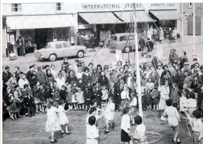
Birchington Brownies dancing around the Maypole - c. 1960s

More recently, the local Brownies celebrated May Day by crowning one girl as "The Queen of the May". They also danced in weaving patterns around the Maypole holding on to the ribbons attached to the top of the pole, plaiting them and afterwards unplaiting them - if all went well!